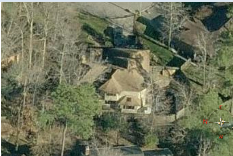
East Side View