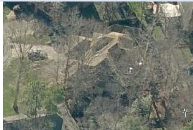
South Side View