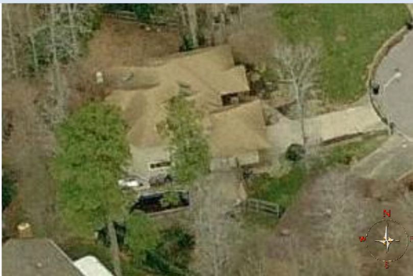
North Side View