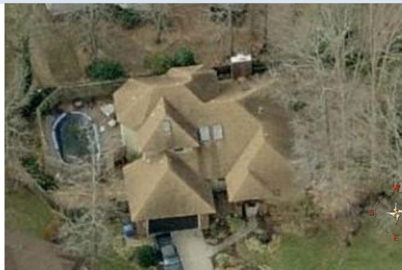
West Side View